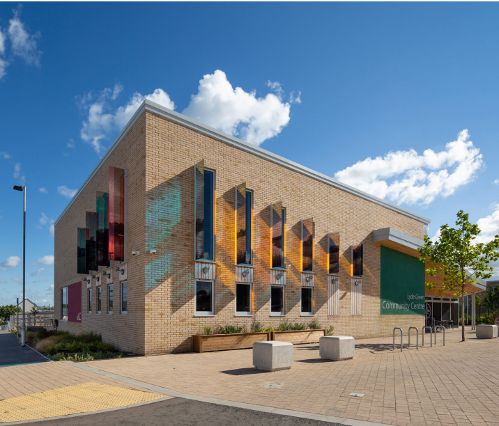
Lyde Green Community Centre, Bristol