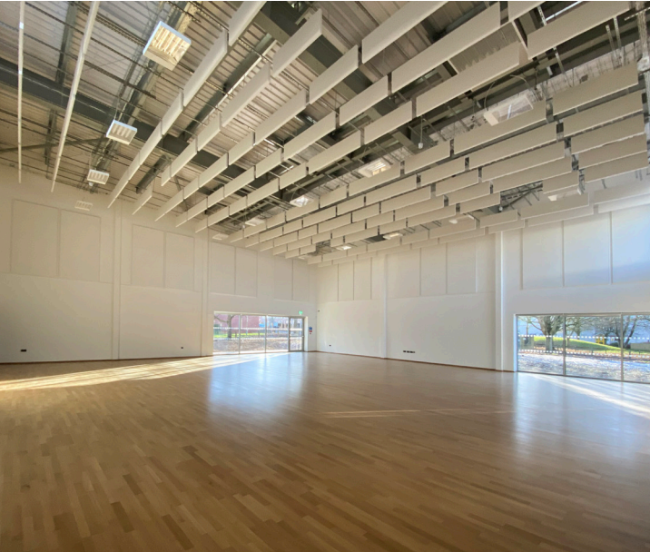
Tidworth Civic Centre and Wiltshire Police CPT Building, Wiltshire