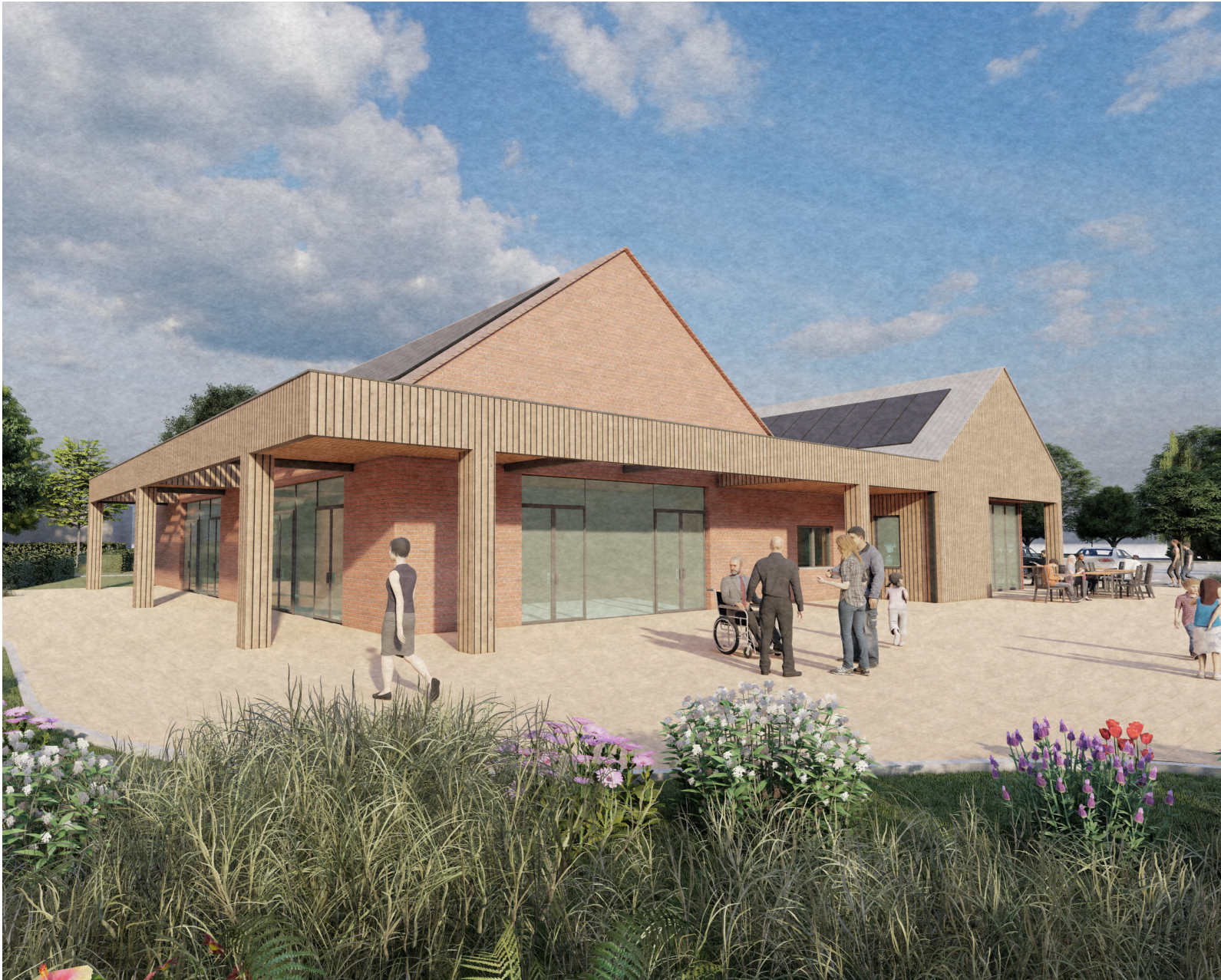
Bromham Community Hub, Wiltshire