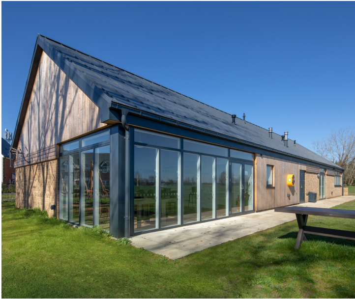
Kingston Bagpuize Pavilion, Oxfordshire