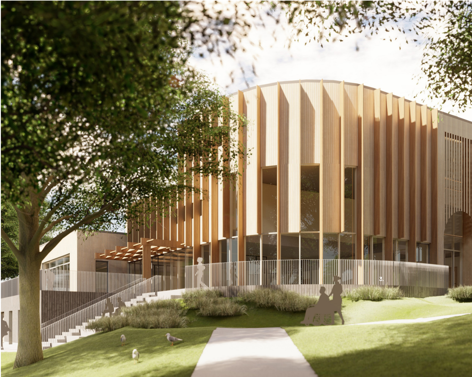
Wildwood Church, Staffordshire

Community engagement is a key component of our design process. We believe meaningful consultation is essential in shaping spaces that are truly reflective of the needs and aspirations of their users. We have extensive experience in organising, facilitating, and leading public consultation events and stakeholder workshops - creating productive forums for dialogue, feedback, and shared ownership of the design vision.