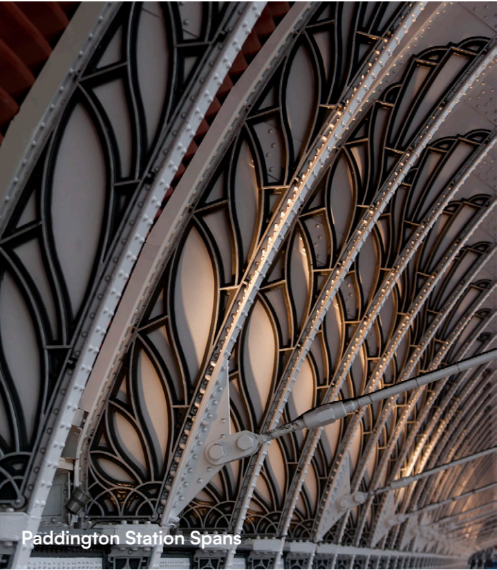
Paddington Station Spans