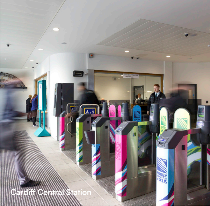
Cardiff Central Station