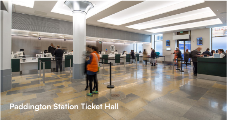
Paddington Station Ticket Hall