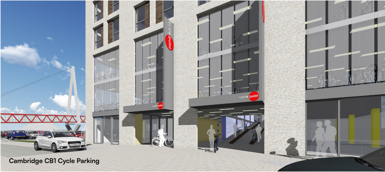
Cambridge CB1 Cycle Parking

In order to assist the client in understanding the design, we create concept drawings, 3D visualisations and detailed layout drawings. By providing detailed creative visualisations throughout the process, you will know exactly how your new space will look and feel once the work is completed.