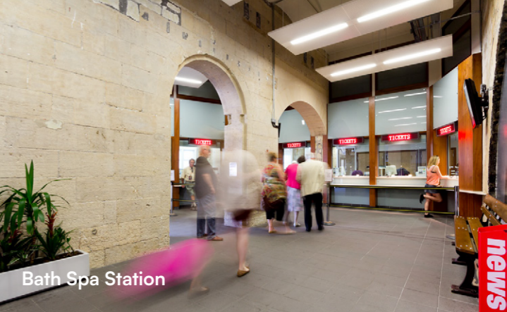
Bath Spa Station