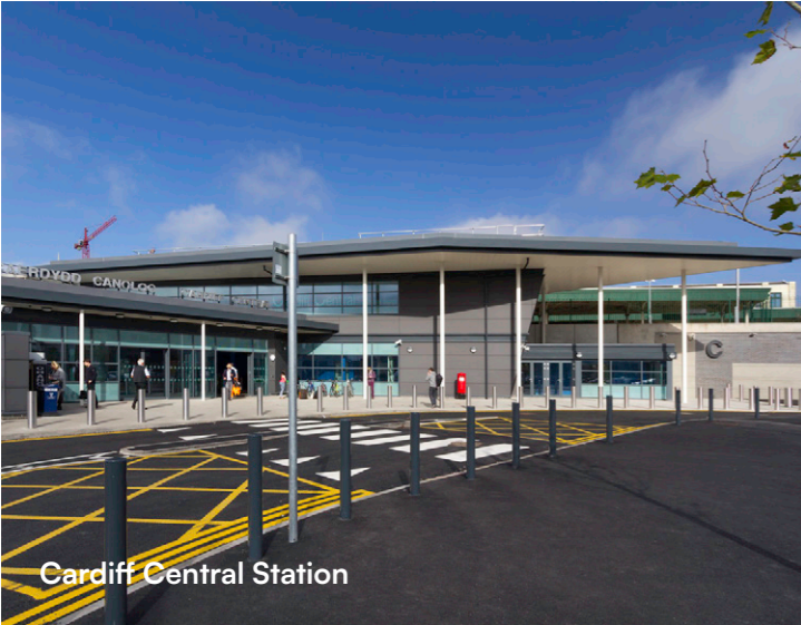
Cardiff Central Station