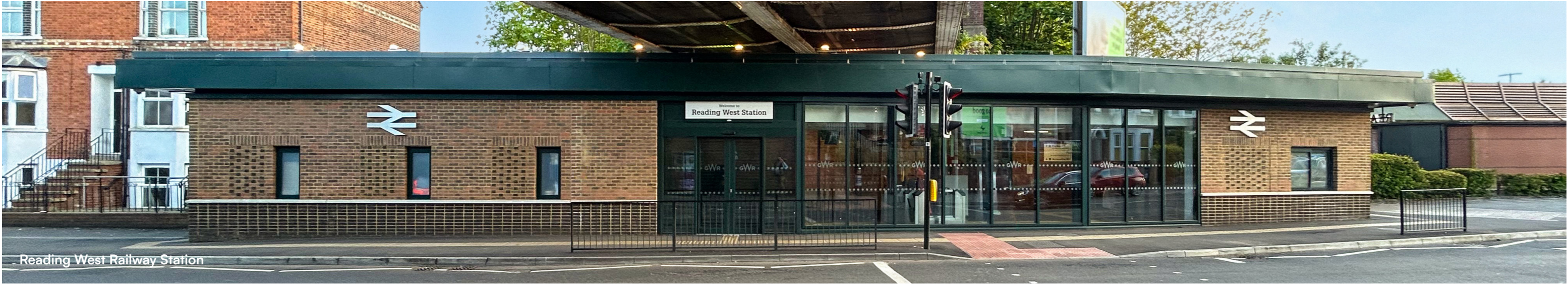
Reading West Railway Station