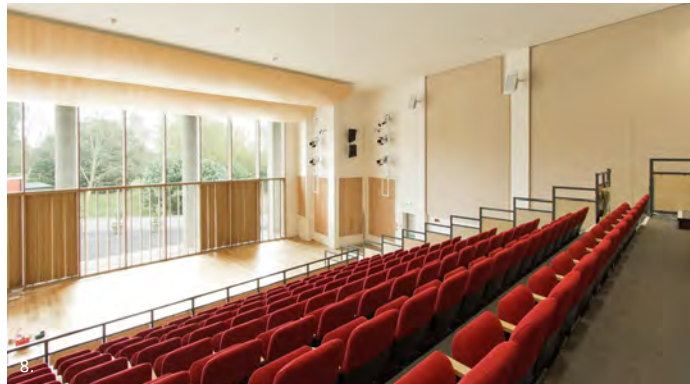
1. St Hugh's School, Music Department 2. John Keats Primary School, Southwark, London 3. Yew Wah International Education Foundation, Bridgwater 4. St Hugh's School, Dovecote Library