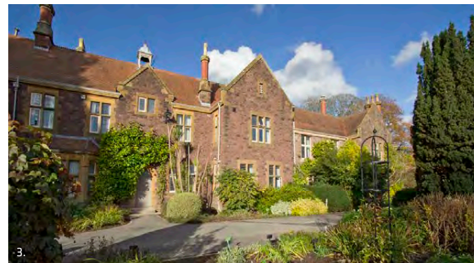
1. H. H. Wills Physics Laboratory, University of Bristol 2. The Chalet Laboratories & Accommodation, Wytham Woods, University of Oxford 3. The Holmes, Student Accommodation, University of Bristol 4. 33 Colston Street, Student Accommodation, University of Bristol