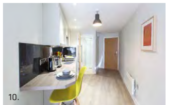
5. Somerville College, University of Oxford 6. Walton St & Little Clarendon St, University of Oxford 7. Sinclair House, University of Bristol 8. Hiatt Baker Hall, University of Bristol 9. Hollybush Lodge, Brasenose College, University of Oxford 10. Creswicke House, Bristol