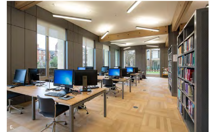
4. Great George Street, Offices, University of Bristol 5. The Robert Hooke Building Clean Laboratories, University of Oxford 6. St Anne's College Library, University of Oxford